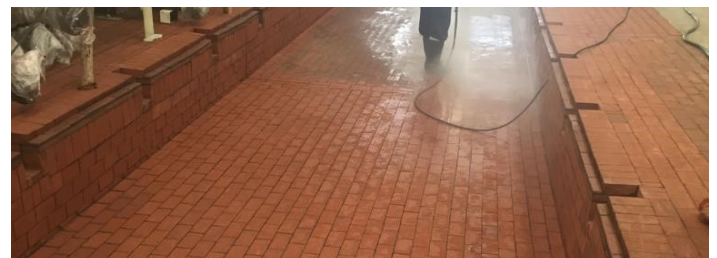
2. Finished battery filling area trench lined with acid-resistant brick, FURALAC Green Panel Mortar, and TUFCEM II SL Membrane.