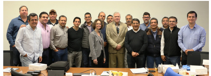
6. Group photo of contractor training at ErgonArmor's technical training center in Jackson, Mississippi USA.

After a safety orientation and technical presentation at the training event, the contractor's crew applied PENNTROWEL Epoxy Primer, TUFCEM II SL Membrane, and FURALAC Green Panel Mortar in a mock installation to get a feel for the products' handling. Once the project got underway, ErgonArmor dispatched experienced US supervision to the jobsite. With experience installing thousands of square meters of acid-resistant brick linings and flooring for US lead-acid battery producers, the supervisor helped the installer tackle the site-specific staging and construction details around floors and curbs, trenches and aprons, tank pads and equipment supports.