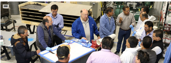
5. Contractor training at ErgonArmor's technical training center in Jackson, Mississippi USA.

Sometimes finding experienced installers is the biggest challenge in sourcing proven technology and materials outside a manufacturer's home country. For the Celaya project, ErgonArmor's sales team in Mexico was able to refer the battery producer to a local factory-trained installer. The installer received project-specific product orientation and installation training at ErgonArmor's global research, development, and technical training center just outside of Jackson, Mississippi, USA.