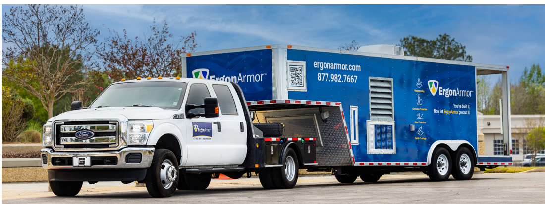
7. ErgonArmor dispatches its mobile demonstration trailer and field technical service team to conduct product training at contractors' offices and clients' jobsites inside the US.

For questions about project support resources wherever your next project takes you, call ErgonArmor at +1-601-933-3595 or send your inquiry to ErgonArmorCustServ@ergon.com .