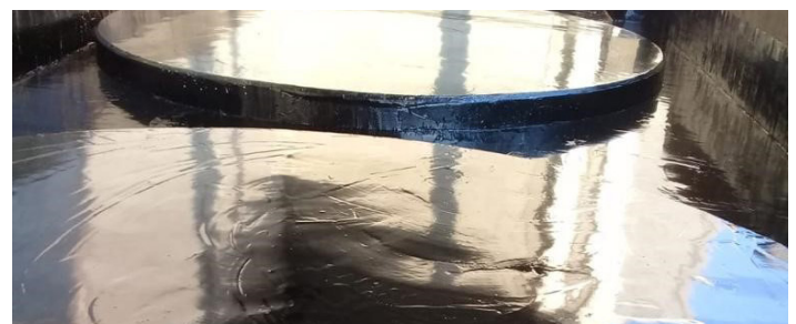
3. Sulfuric acid storage tank farm secondary containment lining with TUFCEM II SL Membrane applied over PENNTROWEL Epoxy Primer, shown before membrane is covered with chemical resistant mortar and masonry.