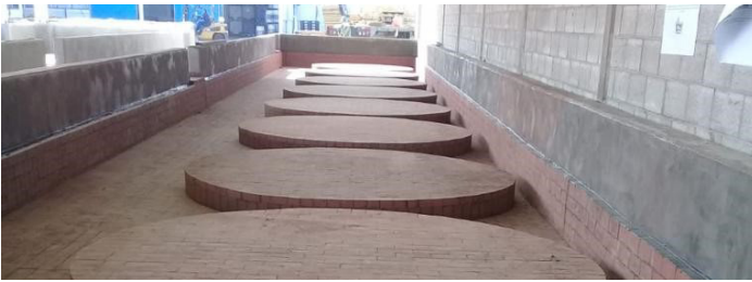
4. Finished sulfuric acid storage tank farm secondary containment area protected against corrosion with acid-resistant brick, FURALAC Green Panel Mortar, and TUFCEM II SL Membrane.

practices. Together with ErgonArmor's technical expertise and product training capabilities, these resources delivered a quality installation.